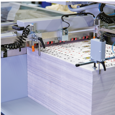
Flat pile feeder for single sheets from 100 gsm up to 0,5 mm