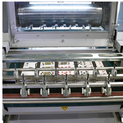
Break out elements for deflecting the sectioning grids and delivering the products. Short setup times, toolless adjusting